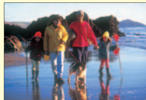
Photo: Whitsand Bay