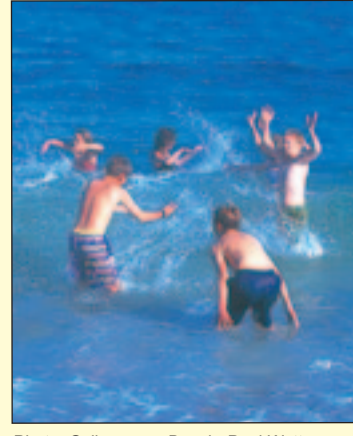
Photo: Gyllyngvase Beach

Front cover photo: Chapel Porth